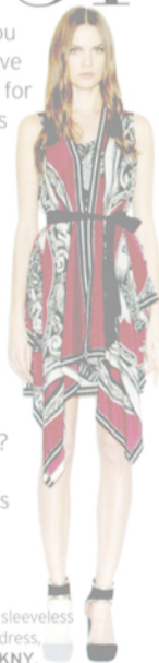
Freya print sleeveless scarf Cozy dress, $790, by DKNY.

Will you be making resolutions for the New Year before the clock strikes midnight? Or will you be too sloshed to give a toss, busy looking for someone to lock lips with? Either way, brace yourself for what we expect to be an exciting and very unpredictable 2012. But before you think too far into the future, have you found the perfect New Year's Eve party dress yet? The scarf-inspired pieces from DKNY's Cruise collection might be exactly what you need.