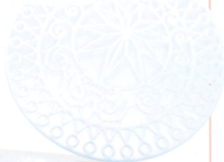
2011 christmas ornament, $220, by CHRISTOFFLE.